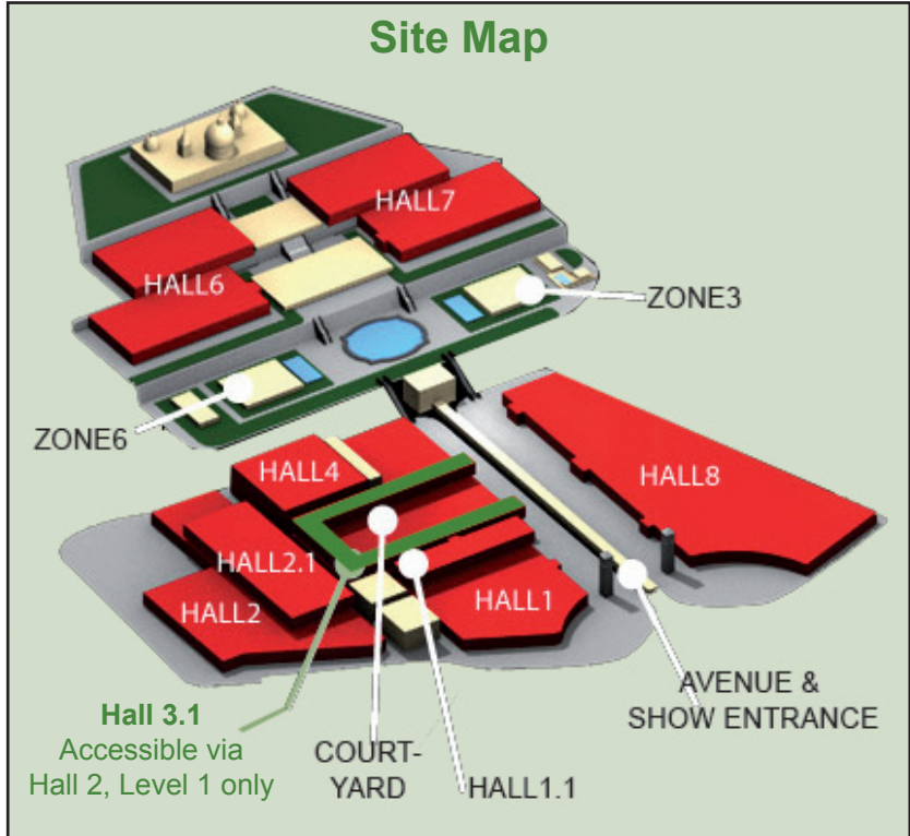
Hall 3.1 (Gallery Level)